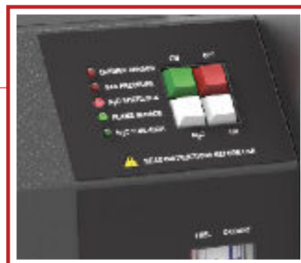
Auto gas box & push button ignition

10" Color touchscreen and supported in the USA