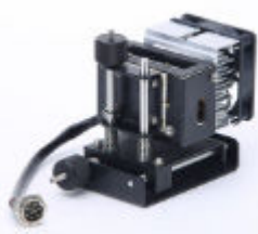
Thermostatic Cell Holder